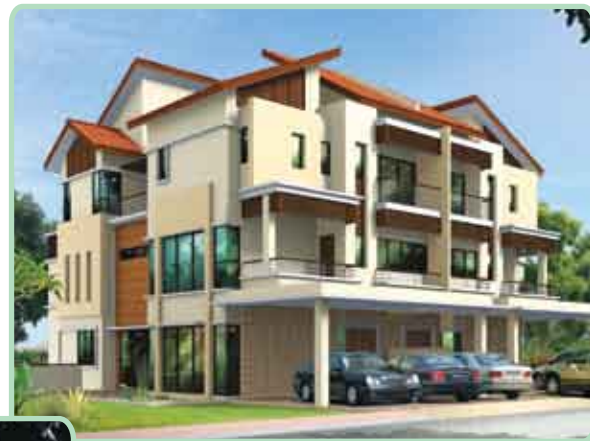
Semi - D Type B