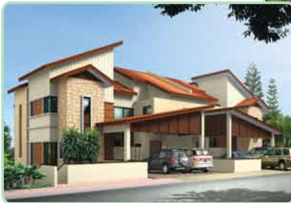
Semi - D Type C1