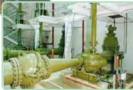
Sg. Muar Durian Tunggal Interbasin Pumping Scheme