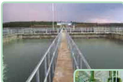
Gurun Treatment Plant

The net earning per share of LLCB Group for the financial year is 19 sen compared to 8 sen in 2005. The net assets per share increased to RM2.41 from RM2.24.