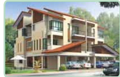
Semi - D Type A2

The Proposed Land Acquisition will expand the Group's geographical presence and increase the competitive strength of LLCB Group. The foray into property development will augur well for the Group as the revenue and profit contributions will further enhance the performance of the Group.